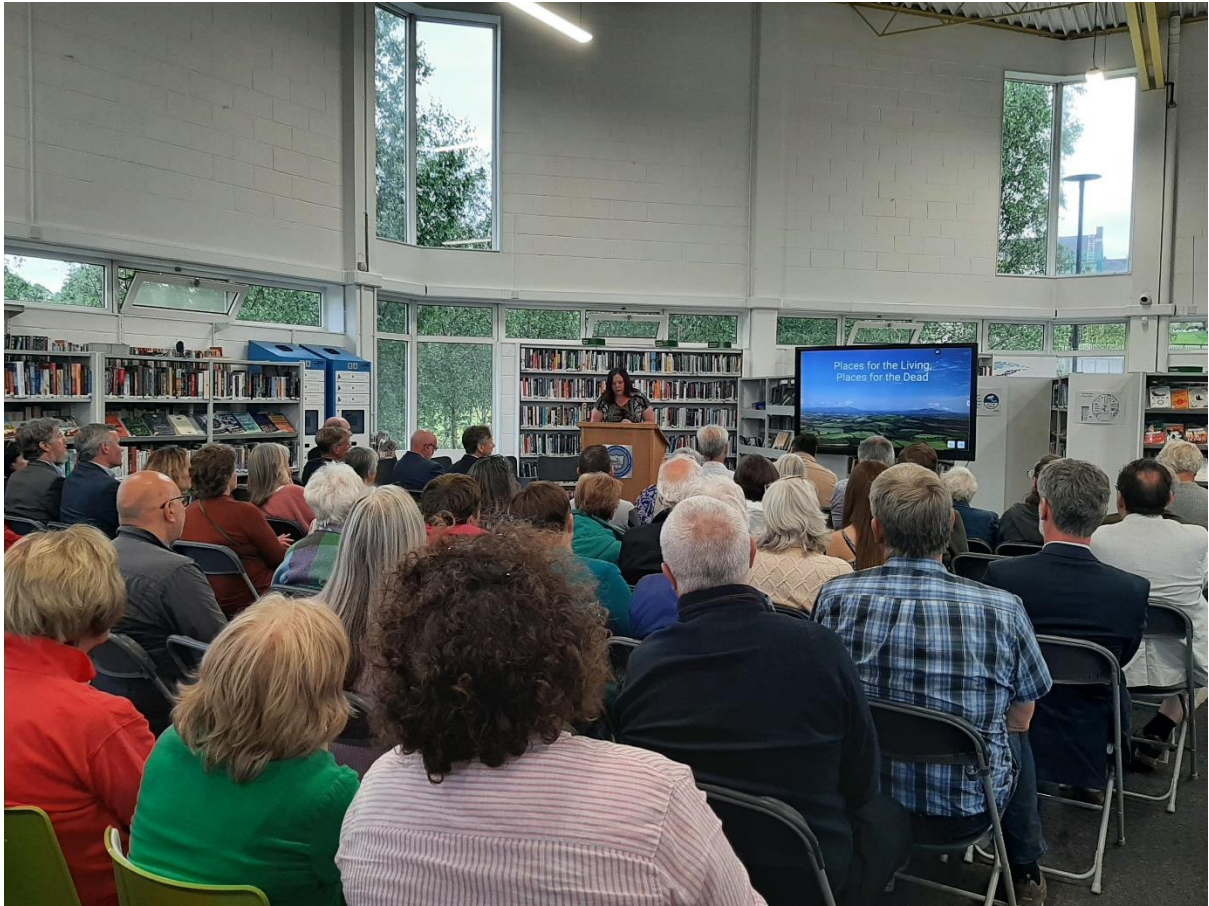
Attendees at book launch